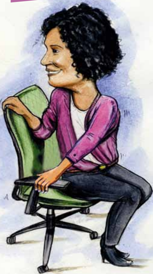
ILLUSTRATION: MARC GOODERHAM